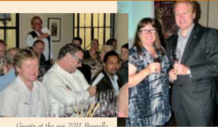
Guests at the our 2011 Brunello, Chianti e Sangiovese Event.