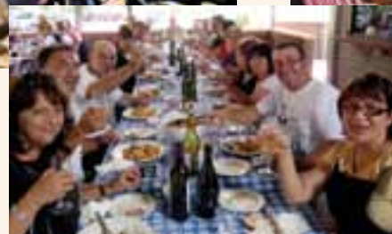
Feasting after the class